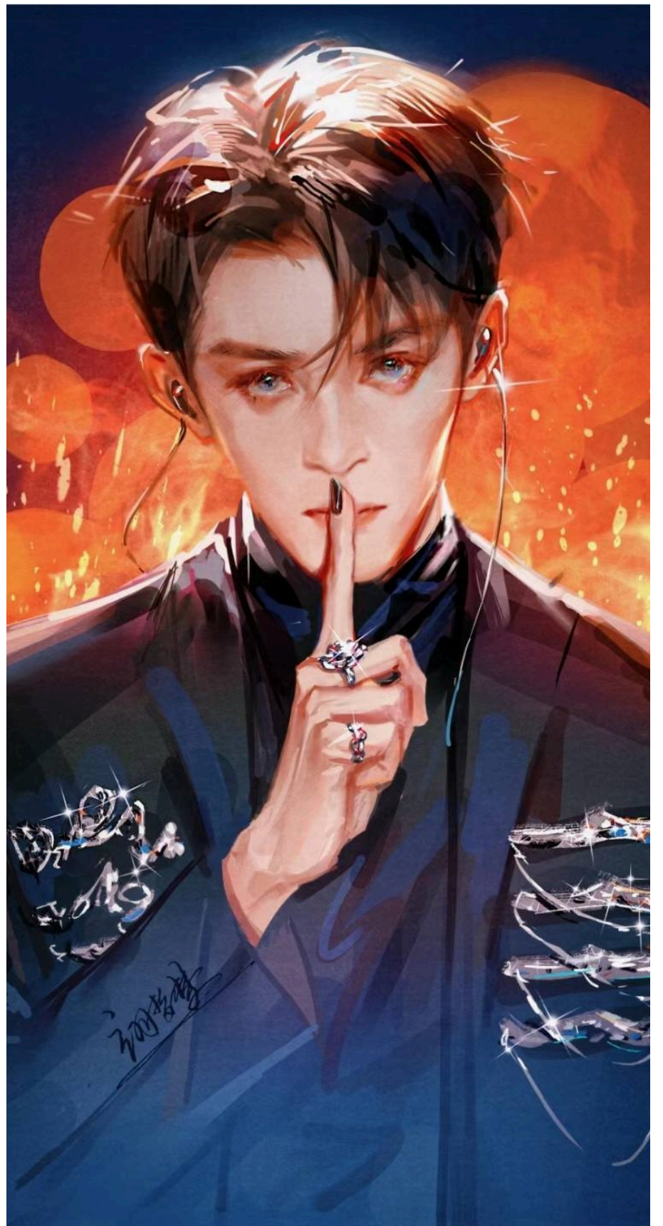
Art by 立羽梦梦 (Weibo)